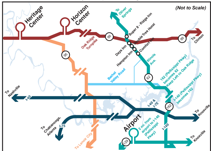
Route from Knoxville McGhee-Tyson Airport to Heritage Center